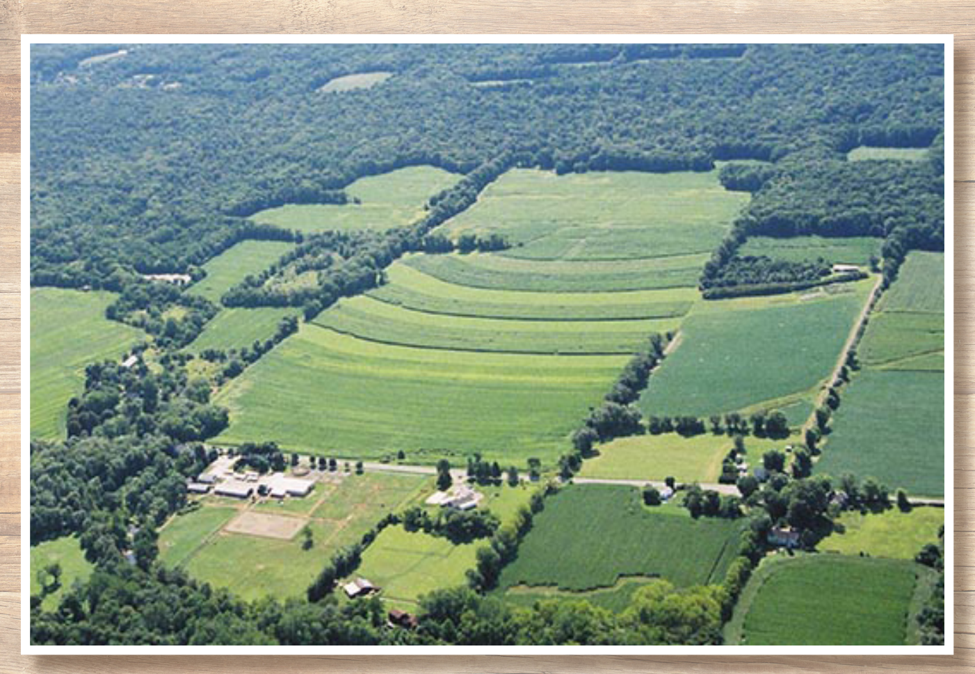
Ethos Farm from the air